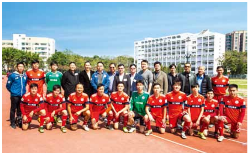
North District Golik soccer team