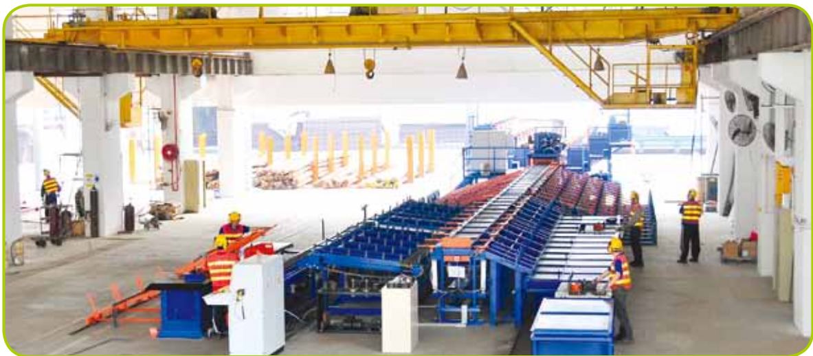
Rebar Value-Added Centre in Tai Po, Hong Kong