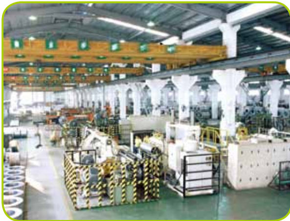
Steel Coil Processing Centre in Dongguan, Guangdong, Mainland China