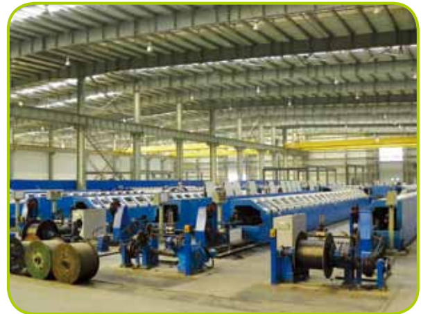
Elevator Wire Rope Production Line in Tianjin, Mainland China