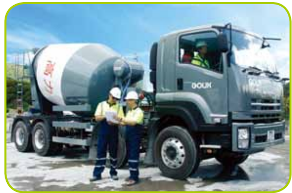
Supply of Ready Mixed Concrete