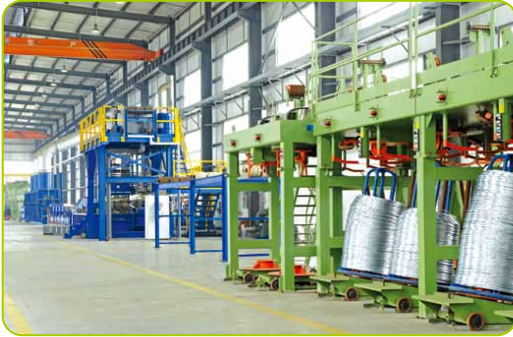
Galvanized Steel Wire Production Line in Heshan, Guangdong, Mainland China